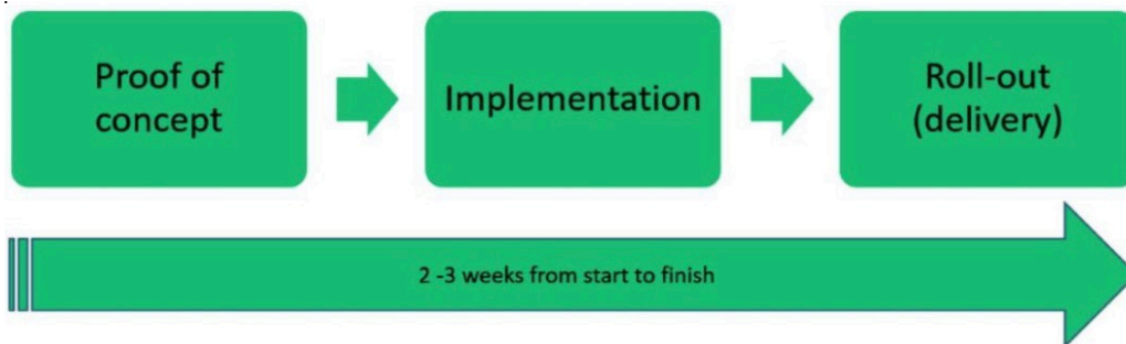
Figure 5. The implementation diagram represents initial Proof-of-Concept installation all the way to production

The wizards also automatically install required software when a new Remote Desktop Session Host is added. This method assures only what is needed will be installed on each server role.