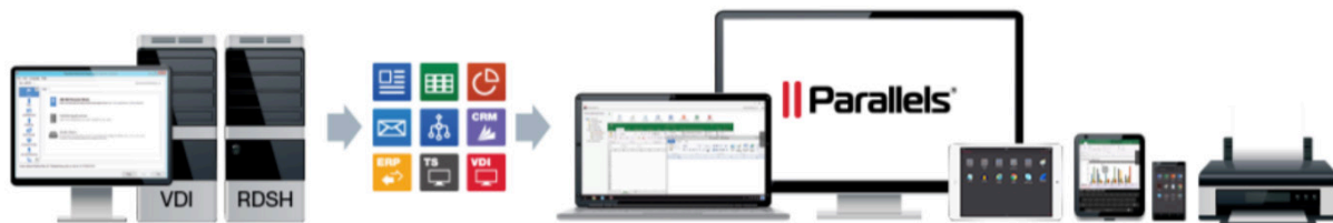
Figure 1. Parallels RAS: How applications and VDI are delivered to end users using Microsoft® Remote Desktop Session Host (RDSH)

Considering the initial capital expense and overall complexity involved in implementing a traditional VDI solution, it's no wonder that many cost-conscious customers, particularly small and medium business, have not adopted this traditional approach. However, with the emergence of software defined, hyperconverged platforms, such as the Hewlett Packard Enterprise Hyper Converged platforms, and affordable comprehensive virtual desktop and application publishing solutions, such as Parallels® Remote Application Server (RAS), the cost and complexity of virtual desktop infrastructure have been greatly reduced. Compared to traditional solutions, implementing Parallels Remote Application Server can save most organizations up to 70% in overall infrastructure and annual licensing costs.